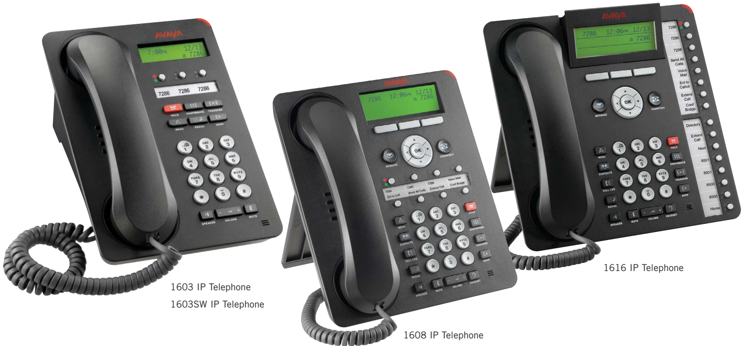
1603 IP Telephone 1603SW IP Telephone